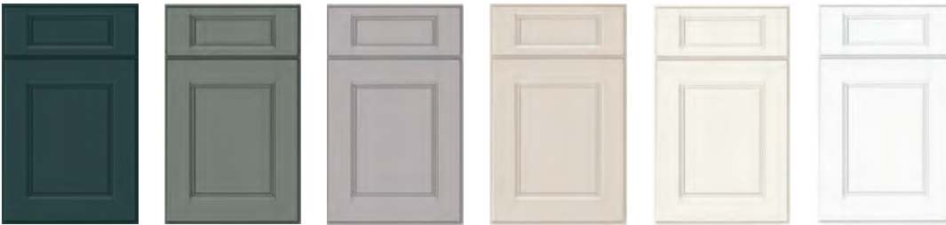
Baltic Slate River Rock Latte Linen Alpine White