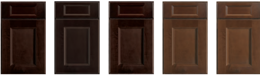
Double Espresso Truffle Espresso Autumn Brown Nutmeg