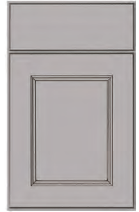
Also available in slab drawer front