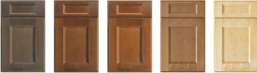
Storm Mocha Café Toffee Crystal